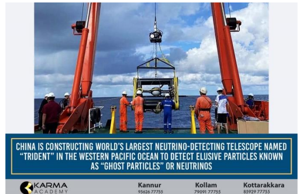
CHINA IS CONSTRUCTING WORLD'S LARGEST NEUTRINO-DETECTING TELESCOPE NAMED "TRIDENT" IN THE WESTERN PACIFIC OCEAN TO DETECT ELUSIVE PARTICLES KNOWN AS "GHOST PARTICLES" OR NEUTRINOS