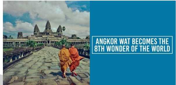
Angkor Wat, located in the heart of Cambodia, has recently earned the prestigious title of the 8th wonder of the world, surpassing Italy's Pompeii.