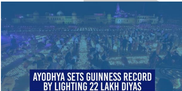
The seventh Deepotsav in Ayodhya set a new world record by emerging as the largest event of lighting lamps together at one location, with over 22 lakh 'diyas' illuminated along the Sarayu river